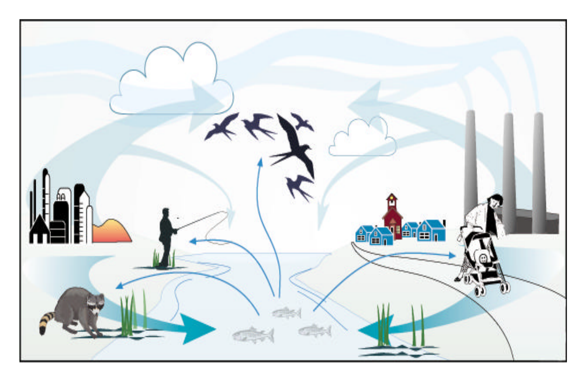
Figure 1. The cycle of mercury in the environment from source to receptor.