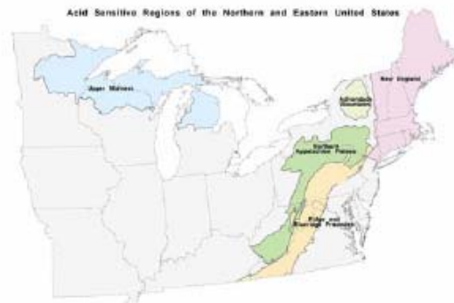
Regions of the eastern U.S. that contain appreciable numbers of lakes and streams sensitive to deleterious effects from acidifying deposition.